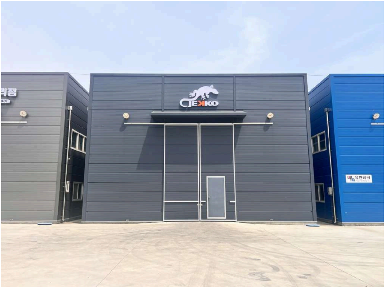
A dedicated Jekko warehouse in Goyang

with the provision of warranty and ongoing service and repair, replacement parts supply and technical advice. It will also hold an inventory of new products that are already inspected (PDI' d) and ready to go, in order to enable same day shipment, when required.