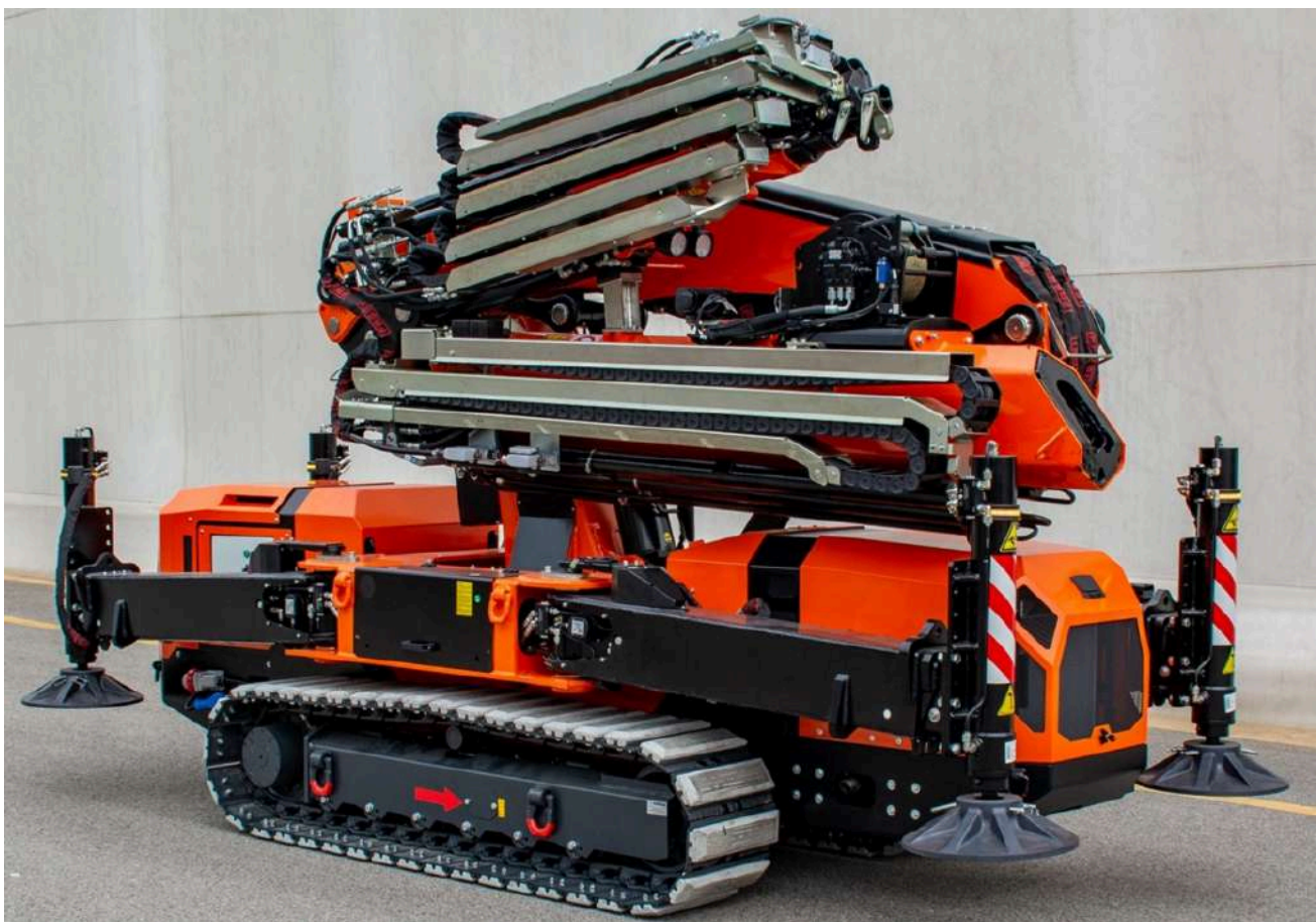
Jekko's latest introduction, the 6.15 tonne JF235

"Jekko has chosen Foster Cranes as its exclusive dealer for the UK market because this company is a strategic, consolidated and well known presence, boasting expertise in technological evolution and undergoing a refurbishment process to higher standards of machinery."